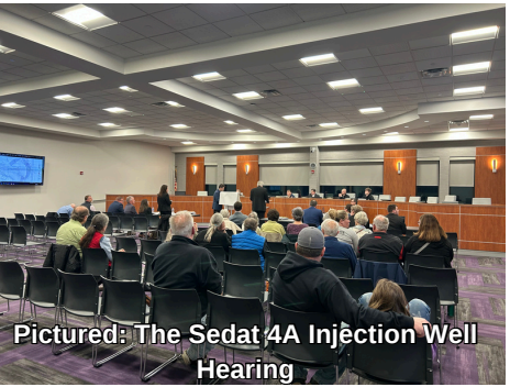
Pictured: The Sedat 4A Injection Well Hearing

In Penn Township, Protect PT’s work has set the stage for renewed consideration of the seven CNX well pads before the Penn Township Zoning Hearing Board, since the original special exceptions for these well pads have expired and the well pads have not been developed. These well pads could be set for hearings at the ZHB in 2026, depending on an upcoming decision of the Commonwealth Court. Zoning Hearing Board meetings are held on the second Thursday of each month