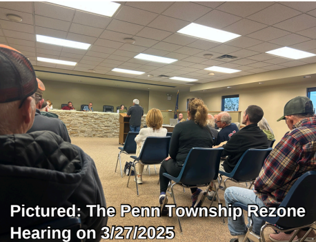
Pictured: The Penn Township Rezone Hearing on 3/27/2025

On October 15 th , the Penn Township Commissioners approved a revised portion of the Penn Township Rezoning plan. The rezoning included the elimination of what had been defined as “Industrial Commerce” zones, and the creation of two new zones called “Heavy Industrial” and “Light Industrial and Commerce”.