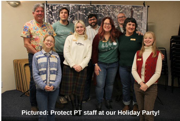
Pictured: Protect PT staff at our Holiday Party!