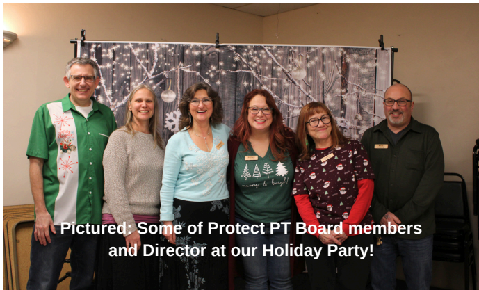
Pictured: Some of Protect PT Board members and Director at our Holiday Party!