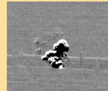
Combustion unit in the dehydrator emitting harmful BTEX chemicals—known carcinogens that pose significant health risks