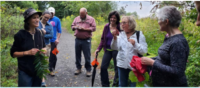
Community Members learned foraging basics at a recent TCWAC Workshop in Murrysville.

We launched our Native Urban Garden Stewardship Program (NUGS) in August, an initiative to create a biodiverse network of backyard habitats by supplying materials, resources, and education in underserved communities. NUGS will be running a pilot program with 2 gardeners in 2023. Our backyard food systems garden program has graduated 6 gardeners this fall and the application is open for 2023 gardeners. We’ve also been having fun with classes, learning about foraging basics and going on a fall hike to see firsthand how abandoned spaces can be transformed back into a natural green space.