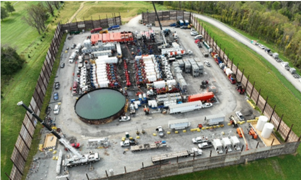
Metis well pad during fracking in PT

Due to increasing gas prices and global events, we have seen a surge of new oil and gas infrastructure proposed with local municipalities and PA DEP. Our communities are asked to sacrifice our health and peace of mind so large corporations can ship their product overseas while devastating our homes and neighborhoods. Residents need to stay vigilant for signs of new infrastructure. These signs include the landman coming to your door, well surveys in the mail, legal notices in the local paper for upcoming hearings and signing up for ENotice (a subscription service with PA DEP). By doing these things, residents have a chance to voice their concerns. Protect PT’s small but mighty staff has been working tirelessly to help neighboring communities and stakeholders here at home to oppose any development that would pose harm. But we can’t do it alone and you shouldn’t have to either. If you know of a new development happening in your area, we can help. Give us a call!